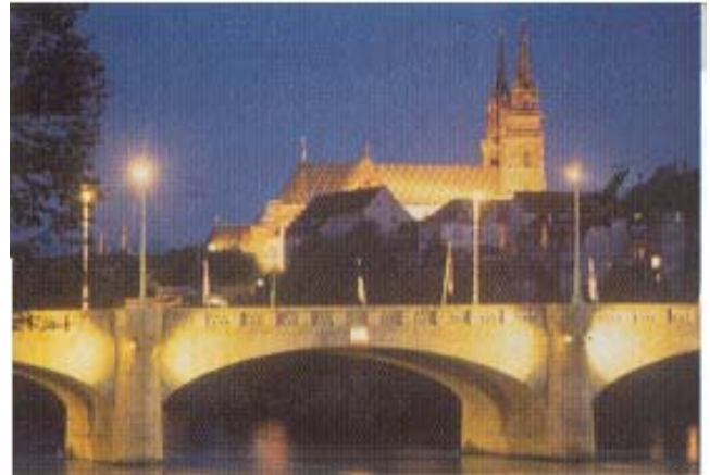
Basle - Münster

about an hour away. We even made Neuschwanstein and back in a day.