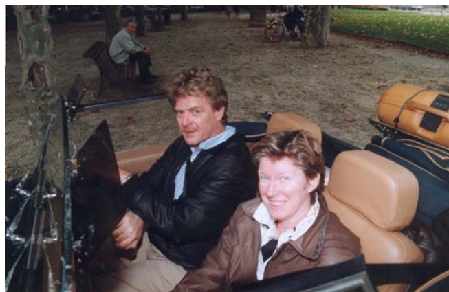
Spot the old-timer!

Moving on through the Carmargue we were plagued by the Mistral as we drove up through Avignon before eventually returning to Switzerland over the French Alps and through the first snows of (an early?) winter.