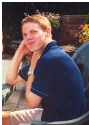
My head's falling off!

first year I broke into the university teams, scoring a hat-trick on my debut. This season I am in the