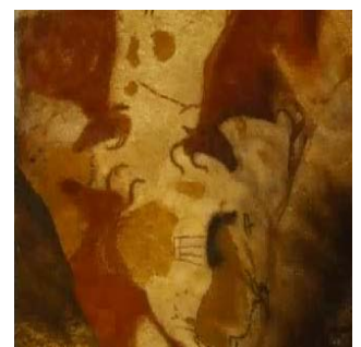
Lascaux cave paintings