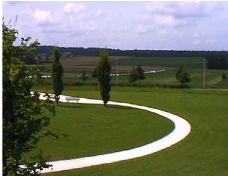
View from the apartment looking north-west towards France